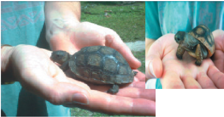
Fig. 3. Dipsochelys hololissa (left) and D. arnoldi (right) hatchlings