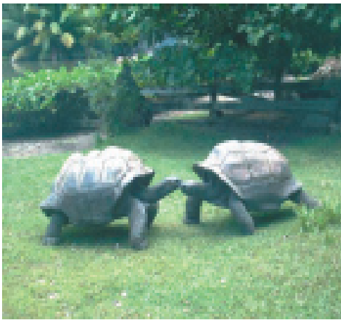
Fig. 1. D. hololissa (right) and D. arnoldi (left) in enclosures on Silhouette island